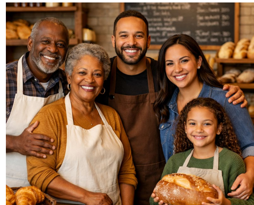
Zeal Credit Union proudly supports our hardworking families and their financial legacies - every step of the way.

It's built over years – by paying it forward.