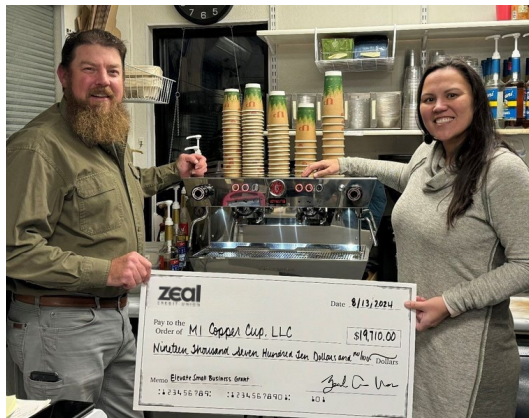
Building legacy one cup at a time, Copper Cup received a $20,000 Small Business Grant thanks to the partnership between FHLB and Zeal CU.